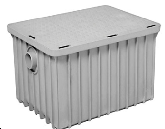
A Typical Grease Trap