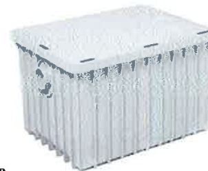
A Typical Grease Trap